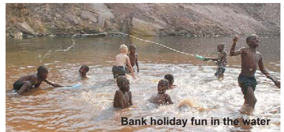
Bank holiday fun in the water