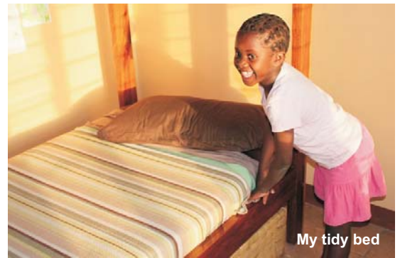
My tidy bed