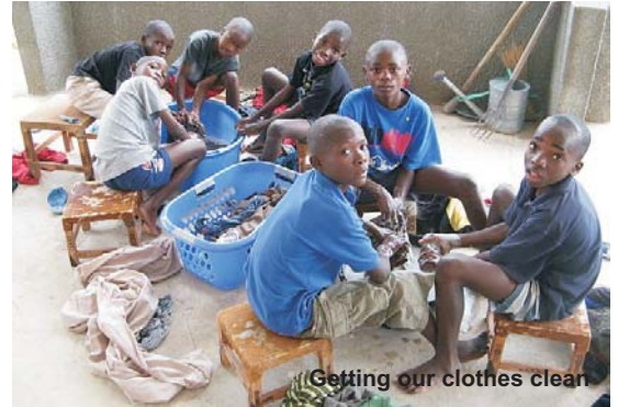
Getting our clothes clean