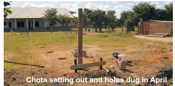
Chota setting out and holes dug in April

With the electrical wiring complete and plumbing nearly done, electrical fittings and sanitary-ware to install together with other fixtures and fittings, we hope to have Hostel 3 building finished by the end of March.