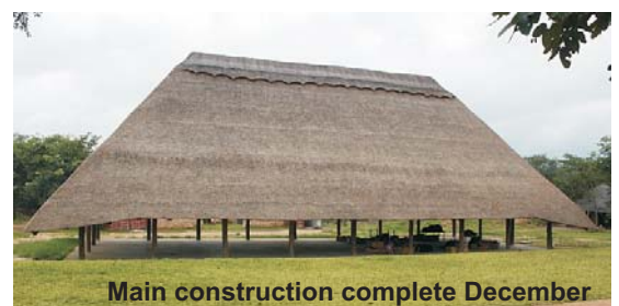
Main construction complete December