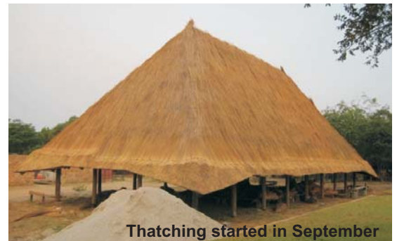
Thatching started in September