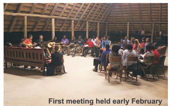
First meeting held early February