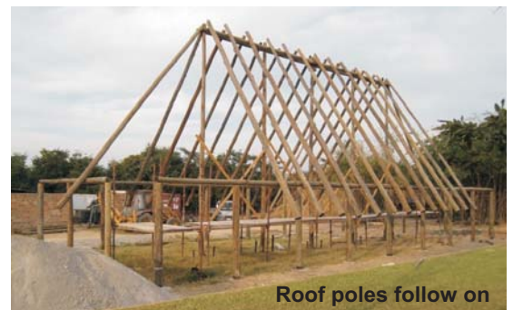
Roof poles follow on